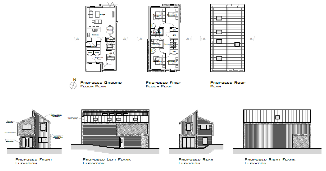
Application 22/504135/FULL - plans and elevations (refused)

harmful to visual amenity, contrary to the National Planning Policy Framework 2021 and Policies DM1, DM9 and DM11 of the Maidstone Borough Local Plan (2017).